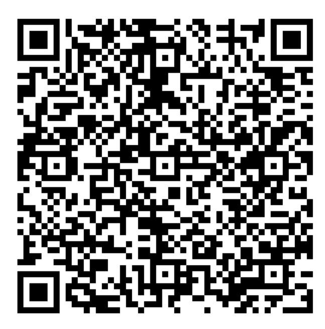
Send your feedbacks to coaches committee