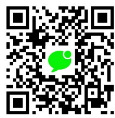
Team Managers WhatsApp channel